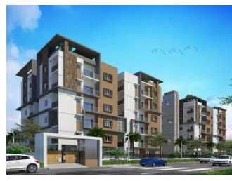
SAI'S SUVIDHA @ Gajularamaram.