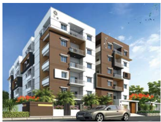
SPOORTHY AVENUE @ Gajularamaram.