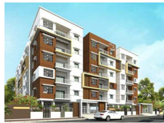
BALAJI CLASSIC @ Sri Balaji Layout, Gajularamaram