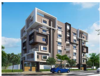
SAI'S SANNIDHI @ Hafeezpet