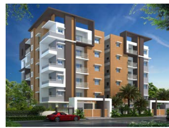
SAI'S SHRAVYA ENCLAVE @ Gajularamaram.